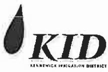
Exhibit A Resolution 2010-17